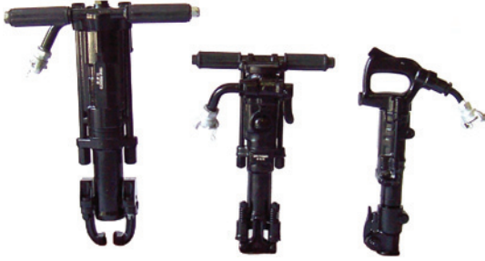
TX18HD (18lb Hammer Drill), TX29RD (29lb) & TX60RD (60 lb) Rock Drills